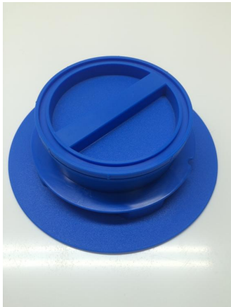
3" Gland Assembly - FILL Comprises of MET0000085 3" Gland (Blue) 3" BSP Internal Thread (Female) MET0000086 3" BSP Male Plug (Blue) MET0000088 3" Blue Nitrile 'O' Ring 82.22mm x 2.62mm