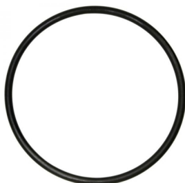
2" Blue Nitrile 'O' Ring 53.64mm x 2.62mm