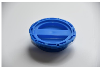
2" BSP Male Plug (Blue) LLDPE