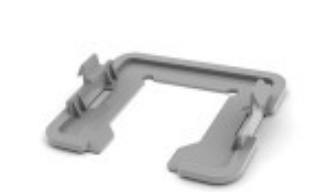
2" Combo Clip.