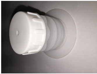
1 Inch Aseptic fill gland

Metano Limited. Units 14/15 Winfield Industrial Estate Rowlands Gill, Tyne & Wear, United Kingdom. NE39 1EH T: +44 (0) 01207 549 448 F: +44 (0) 01207 549 447 E: sales@metano.com W: www.metano.com