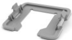
2" Combo Clip.