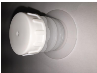
1 Inch Aseptic fill gland