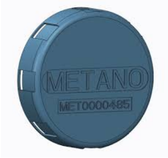
DN50 DIN11851 Disposable Cap (Blue) manufactured from PP Food safe and FDA material

Metano Limited. Units 14/15 Winfield Industrial Estate Rowlands Gill, Tyne & Wear, United Kingdom. NE39 1EH T: +44 (0) 01207 549 448 F: +44 (0) 01207 549 447 E: sales@metano.com W: www.metano.com